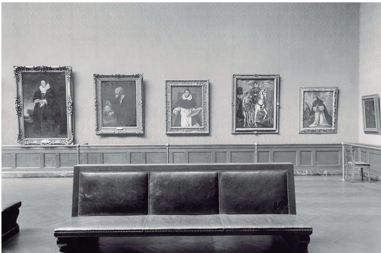
11. El Greco's paintings displayed at the Museum of Fine Arts in Boston in 1930 (by unidentified photographer). Fray Hortensio Félix Paravicino , Saint Martin and the Beggar , and Saint Dominic in Prayer .