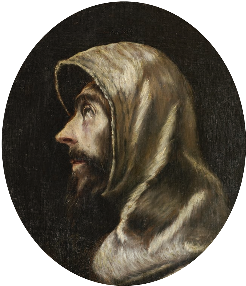
13. El Greco, Head of Saint Francis , ca. 1600. Oil on canvas, 45.3 × 39 cm. New York, The Hispanic Society of America.