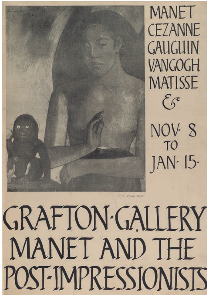
12. Poster of the exhibition Manet and the Post-Impressionists , designed by Roger Fry for the Grafton Gallery, London, November 3 to January 15, 1910. London, The Samuel Courtauld Trust, The Courtauld Gallery.

technically he was far ahead of his period and, although tolerated, he was certainly not appreciated or understood even in the Spain he saw so profoundly. He would have been regarded as a fanatic to the majority of almost any date. . . . If El Greco had lived in our day he might have devised something similar [to Cubism]. . . . Impressionism for him, as for Cézanne, would have been but a means to an end—as it was indeed in his own life when effects of light, cold, or incandescent were conceived and controlled for emotional expression. 51