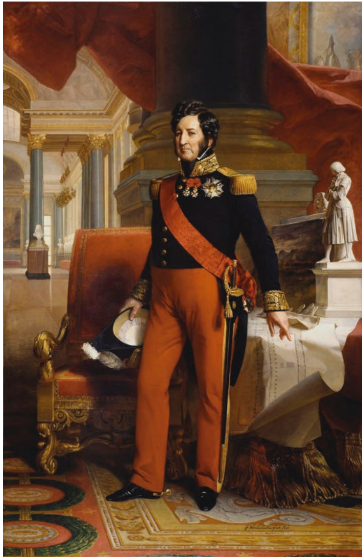
5b. Franz Xaver Winterhalter, Louis-Philippe de Bourbon , 1841. Oil on canvas, 284 × 184 cm. Versailles, châteaux de Versailles et de Trianon.

The general European public was introduced to El Greco in 1838 at the opening of Galerie Espagnole of King Louis-Philippe (1773–1850; fig. 5a–b), one of the most controversial collections ever formed. 16 Benefitting from the secularization of the monasteries under the liberal government briefly headed by Juan Álvarez Mendizábal (1790–1853), French agents operating under the direction of Baron Isidore-Justin-Séverin Taylor (1789–1879) traveled secretly to Spain from October 1836 to April 1837 and secured more than four hundred paintings for the king’s collection, which was exhibited at the Louvre, Paris from